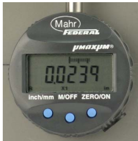
Figure 2: Indicator Face

For additional information on the use of the SPC Data Port output, see the Mahr Federal Inc. document, A-274rev.A included with the Almen Gage.