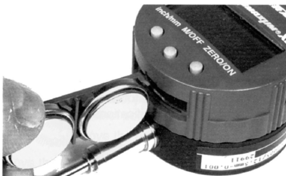
Figure 6-2c Changing the Battery