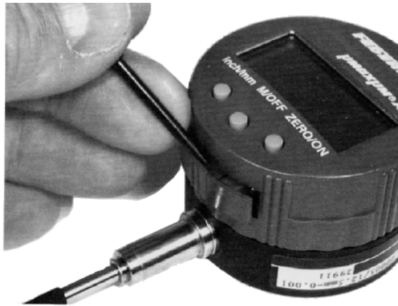
Figure 6-2a Changing The battery