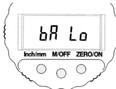
Figure 6-1 Battery Low Indication

A. A battery low is indicated when the indicator displays “bALo” . The indicator will not function until new batteries (2) are installed. Use (2) CR2450 cells.